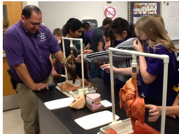
6th grade D.A.R.E. students look and smell the lungs after the effects of smoking.